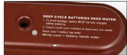
Water Indicator Signal