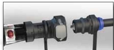
Coupler Connection with Water Flow Indicator