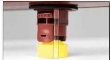
Independent Water Level Indicator

HydroLink™ watering system comes with a four-year, limited warranty.