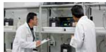
Prototype development and evaluation

Quality and innovation are the cornerstones of our product development. As the leading manufacturer of flooded, deep cycle batteries, Trojan retains two state-of-the-art research and development centers dedicated exclusively to battery technology and innovation. Engineering teams, backed by over 200 years of deep cycle development expertise, work together to innovate and bring to market advanced battery technologies that exceed our customers' expectations for outstanding battery performance.